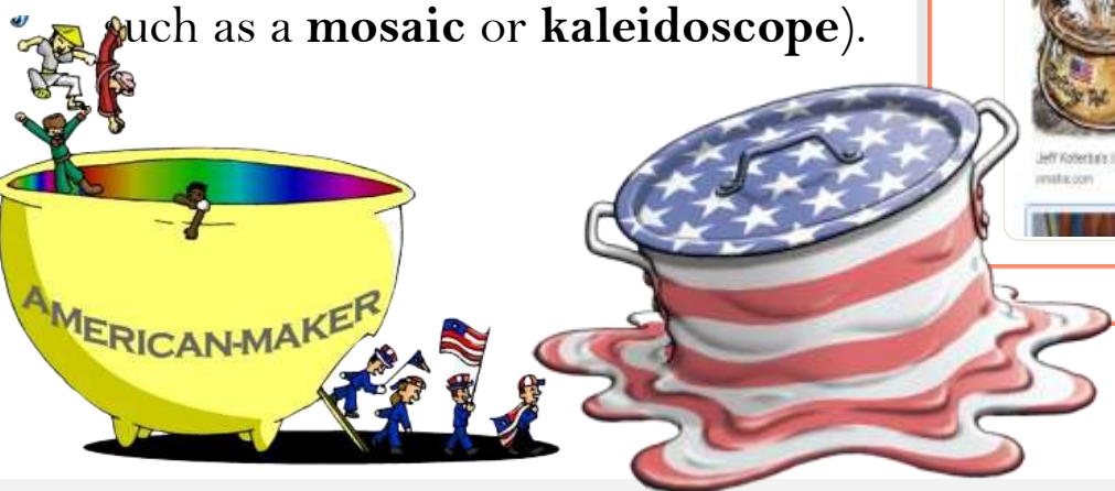
← The great American melting pot according to some conservatives